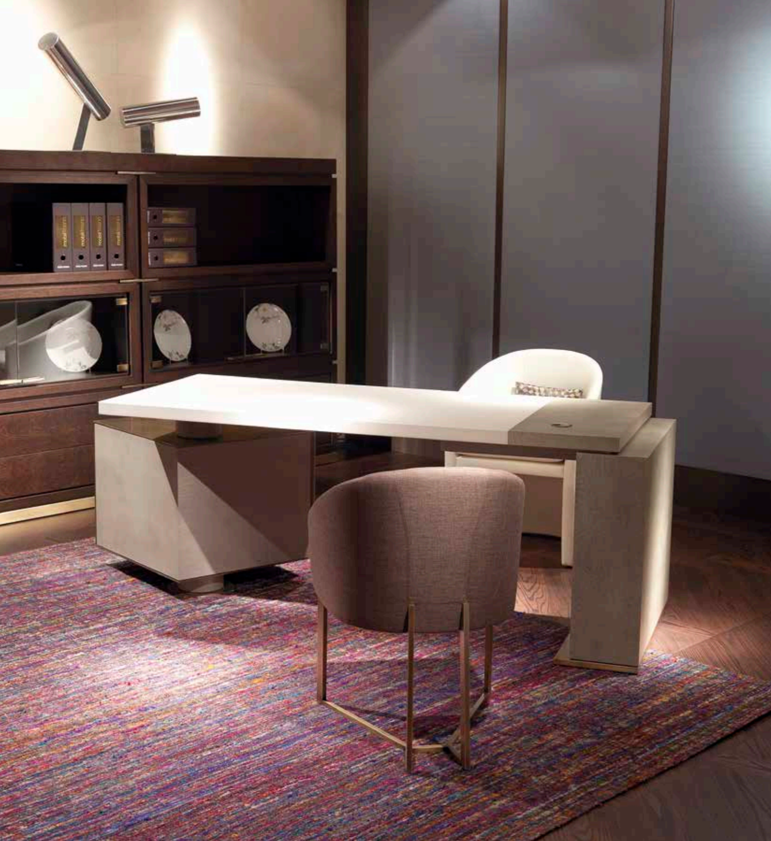
Parker Desk / Escritorio / Bureau