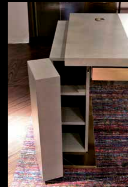
Parker Desk / Escritorio / Bureau